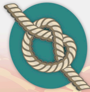
SORcery (BLOWING ON KNOTS)