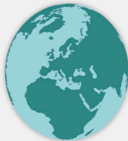
POTENTIAL EVIL OF CREATION