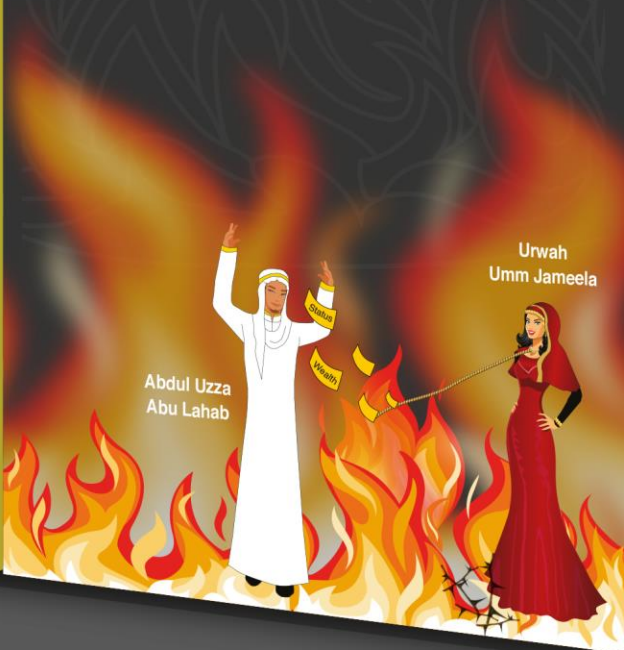
Abdul Uzza Abu Lahab