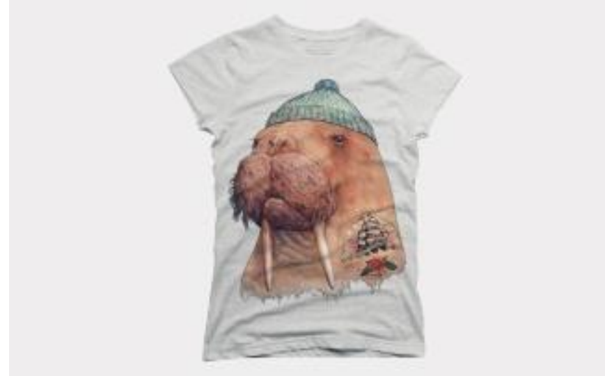
Clothing with images